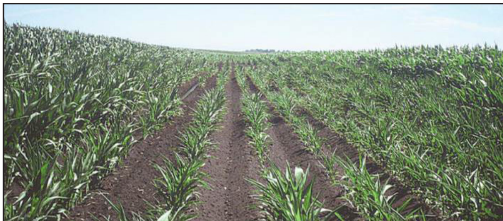
Figure 2. Improperly spaced subsurface drainage resulted in non-uniform leaching of soil salts leading to extreme stunting in the saltier areas of the field. Note the lack of overt salt toxicity symptoms in the stunted plants. ECe in the non-affected area was 0.5 dS/m and 5-8 dS/m in the affected areas.

Calcium may be the exception to this generalization. For crops known to be sensitive to calcium related disorders, the effects are often exaggerated under saline conditions. As soil salinity