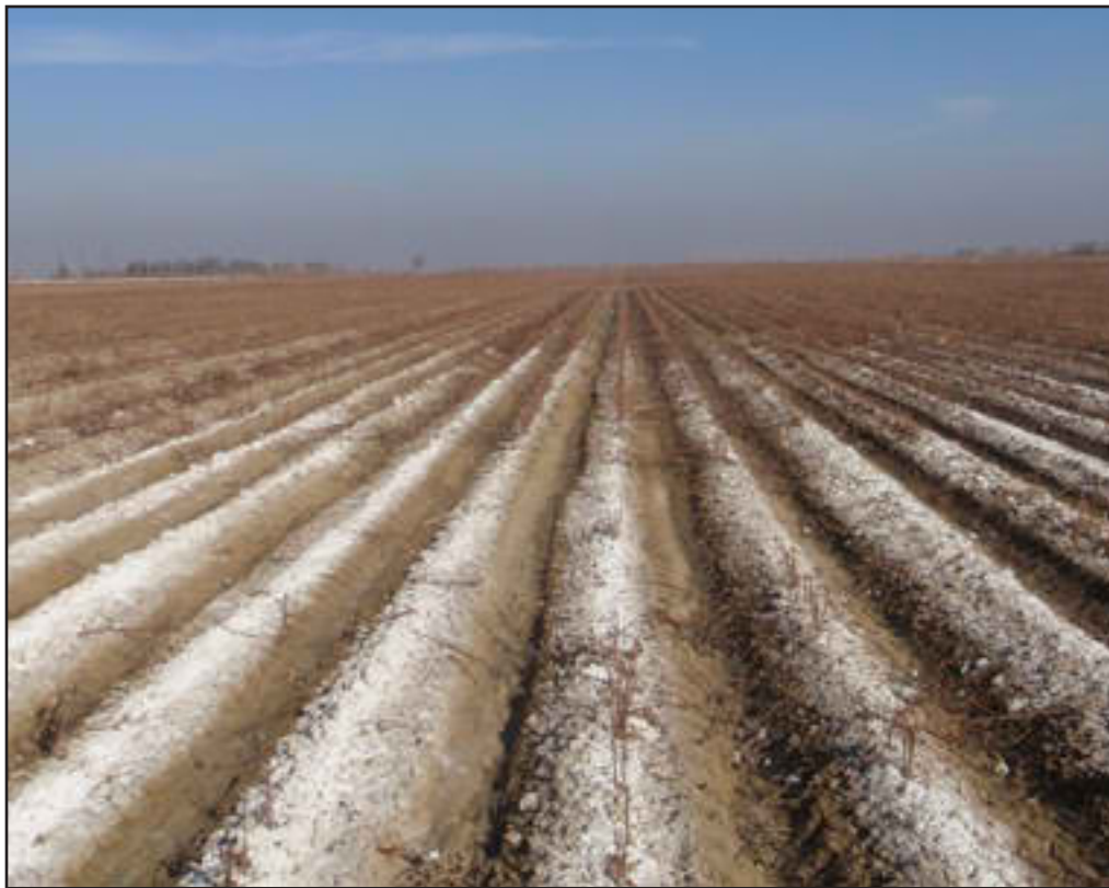
Figure 1. Visible salt accumulation will become a more common site in California as grower's reliance on salty ground water increases.