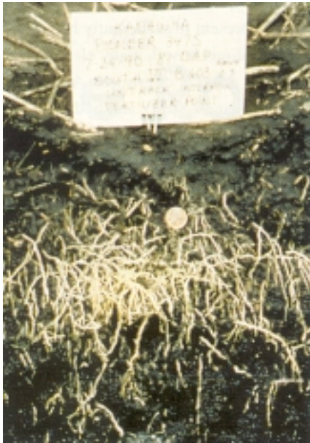
Figure 1. Corn root proliferation in a fertilizer band.

through soil pores and rapidly extend into the profile. The effect on root distribution in a controlled-traffic system can be dramatic.