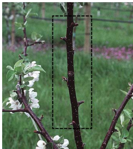
Figure 2. 'Blossom blast' symptoms (indicated by dashed box) as observed in spring of 1994 on apple trees in the experimental block.

Five years of N and K fertigation treatments tended to decrease leaf B concentrations with significant decreases observed as rate of fertigated N increased in 1992 and 1995, plus the addition of K fertigation the last three fruiting years (1994 to 1996). These relative decreases in leaf B concentration likely resulted from dilution due to growth stimulation, especially by K fertigation. Cultivar consistently affected leaf B concentration with highest annual leaf B concentrations measured for 'Fuji' and 'Spartan' cultivars from 1994 to 1996 (Figure 1).