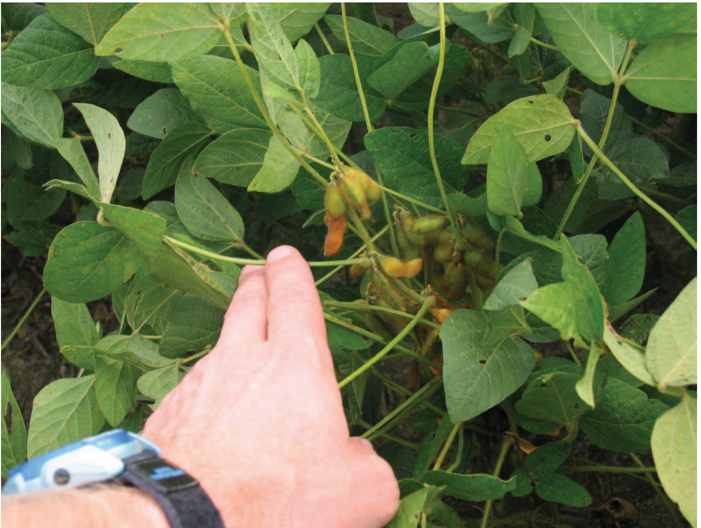
Figure 1. B-deficient soybean pods, Slaton, U. of Arkansas, 2003.

Absorption. Once the application is made most of the material is absorbed into the plant within a few