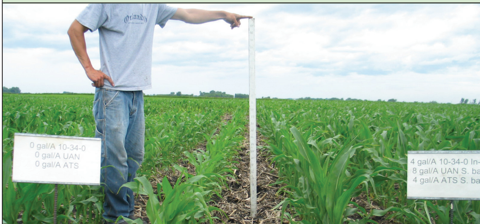
Figure 1. On left no starter. On right 4 gal/A of APP applied in-furrow plus 8 gal/A of UAN and 4 gal/A of ATS applied as a surface dribble band 2 inches to the side of the row (June 21, 2010).

The Fluid Journal • Official Journal of the Fluid Fertilizer Foundation • Early Spring 2012 • Vol. 20, No. 2, Issue# 76